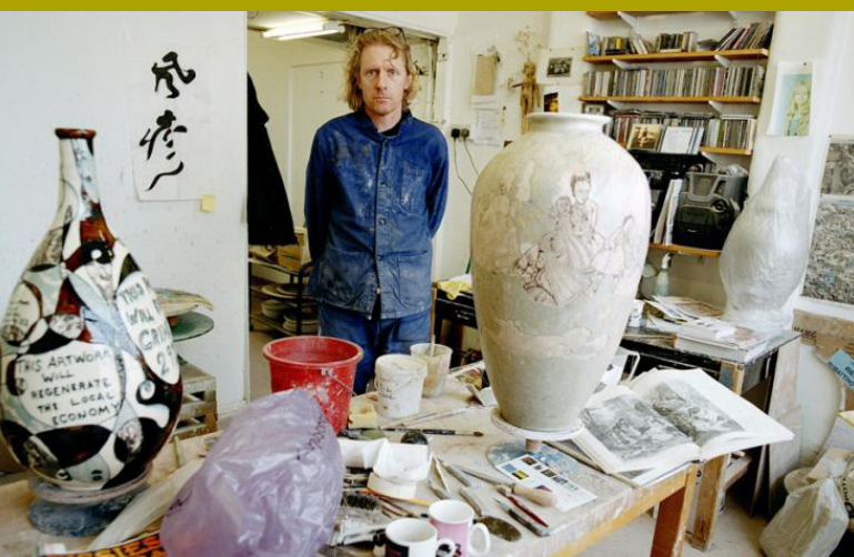
Grayson Perry in his studio

These FREE talks are open to ncas members