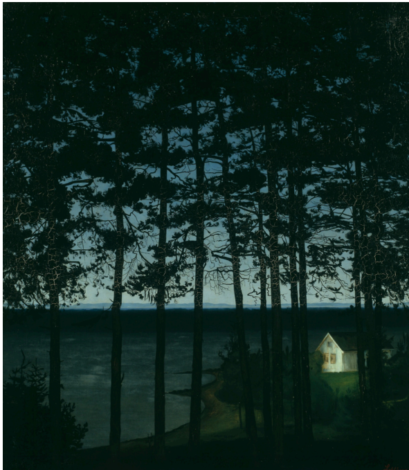
Harald Sohlberg "Fisherman's Cottage" [1907]