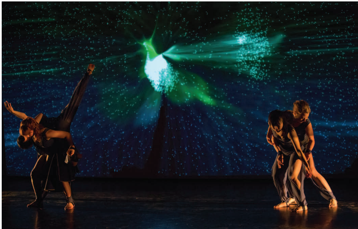
Fig. 7. Photograph of the Hidden Fields performance taken at the 2013 Seeing Sound Symposium.