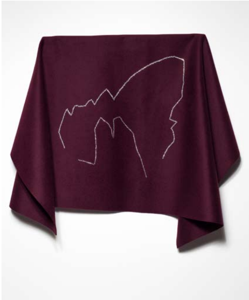
Silhouette of Fire (2016) Flat gems (imitation crystal), cashmere wool 65 x 65 cm (when installed)