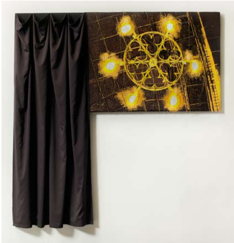
A Deep Prayer (2016) Viscose rayon threads, cotton, polyester fabric 168 x 163 x 10 cm