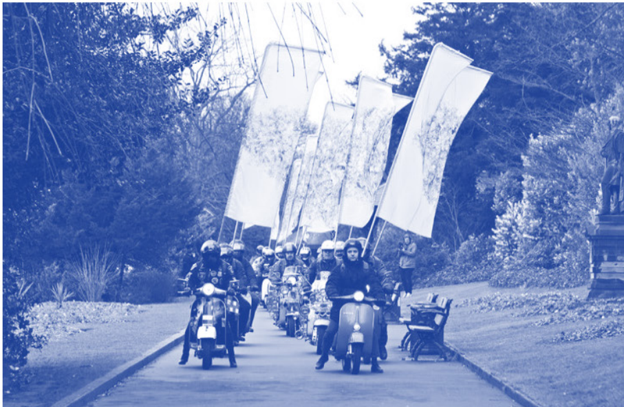
Richard William Wheeler, Tree and Scooters , 2013. Acts of Making Festival 2015, Shipley Art Gallery.

A Crafts Council Touring Project in partnership with Plymouth City Council [Arts and Heritage] and Plymouth College of Art.