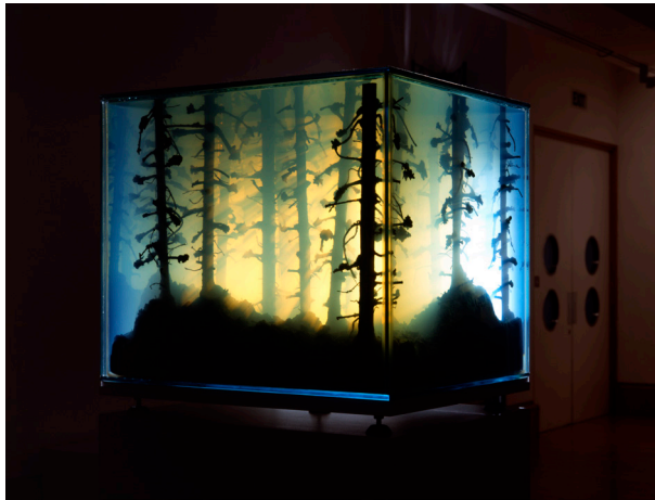
Mariele Neudecker, Things Can Change in a Day , 2001