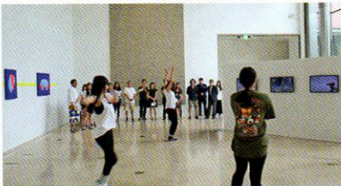
3 Young In Hong Let Us Dance, 2014, performance, 13'-17", Plateau Samsung Museum of Art, Seoul