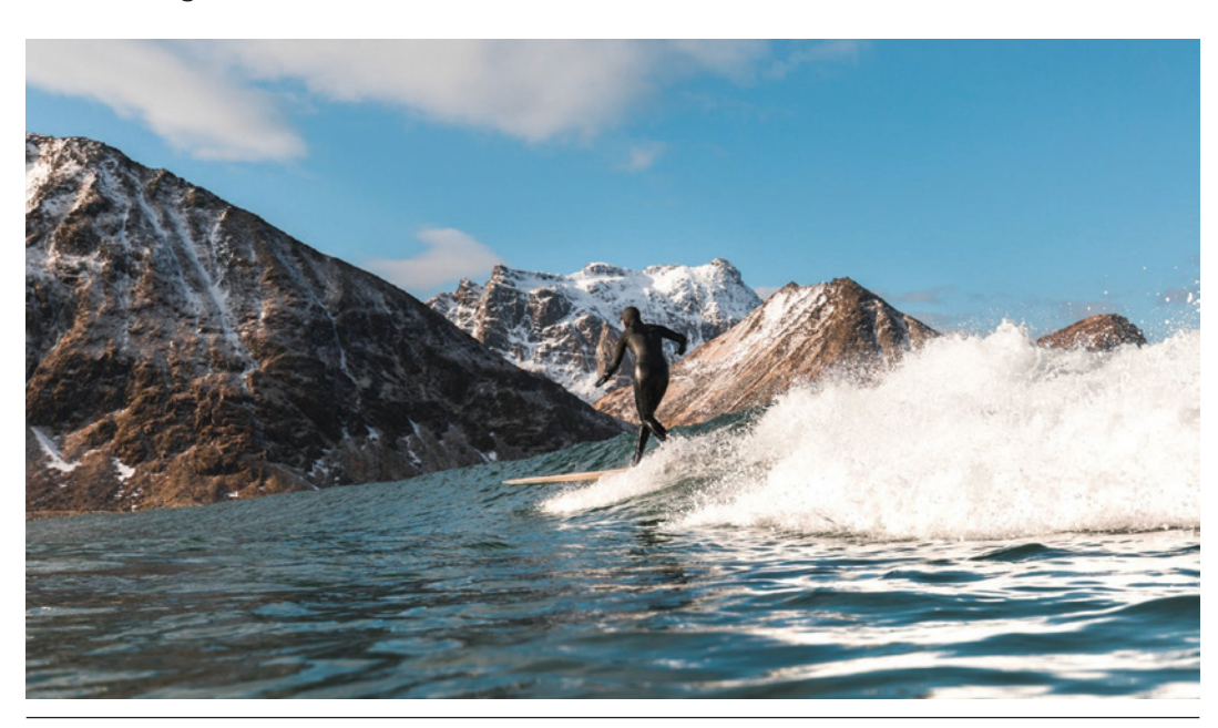
Figure 1: Audiovisually recorded audience feedback and event highlights from Shextreme Film Festival 2016, documenting the audience's increased awareness and deeper understanding of women in extreme sports and adventure as a result of attending the film festival

An unexpected outcome of this increased awareness of women in extreme sports and adventure as a result of attending Shextreme Film Festival has led to further amplification of increased awareness and understanding and, most importantly, decisive action. The film festival provided a useful meeting platform for like-minded women, which has led to the birth of numerous film projects. Women attending the festival have gone on to make their own films to submit to future Shextreme Film Festival editions. For example, athlete and journalist Monet Adams, who attended and wrote about the festival from its inception (Adams, 2015), went on to world premiere her mountain biking film Just Be, filmed in Norway, at 2019's Shextreme Film Festival.