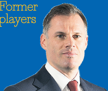
Jamie Carragher 38 England caps