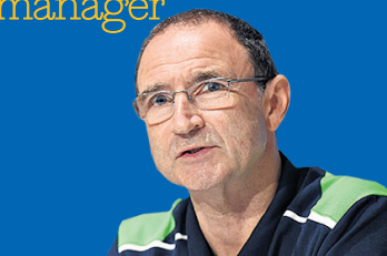
Martin O'Neill Republic of Ireland, 49 matches