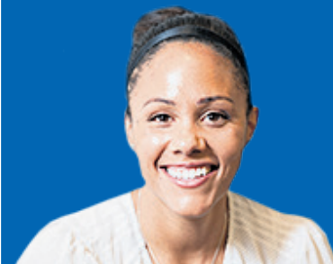
Alex Scott 140 England caps