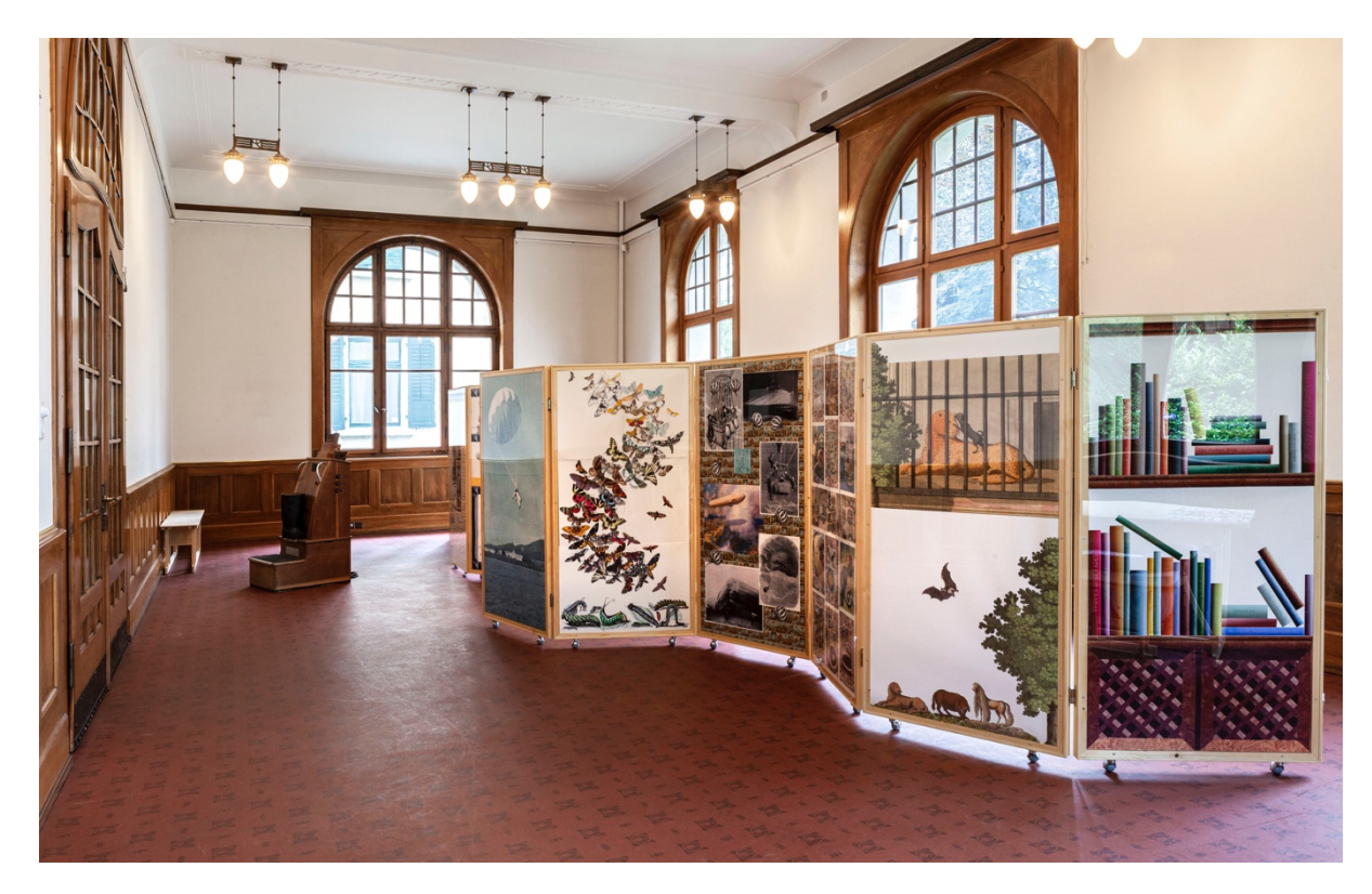
The giant 'leporello', Library of Marvels, on display at the Vadiana, August 2020