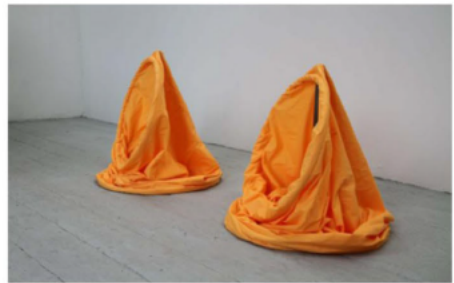
J.Dunseath, Cones . 2013 Cotton fabric, steel and plastic

Sand Cast aluminium Process (to view film of process-click to follow link)